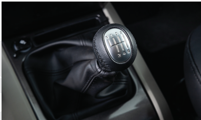
SIX-SPEED MANUAL GEAR SHIFT AND LOW-RANGE/HIGH-RANGE SELECTION (4X4 ONLY)