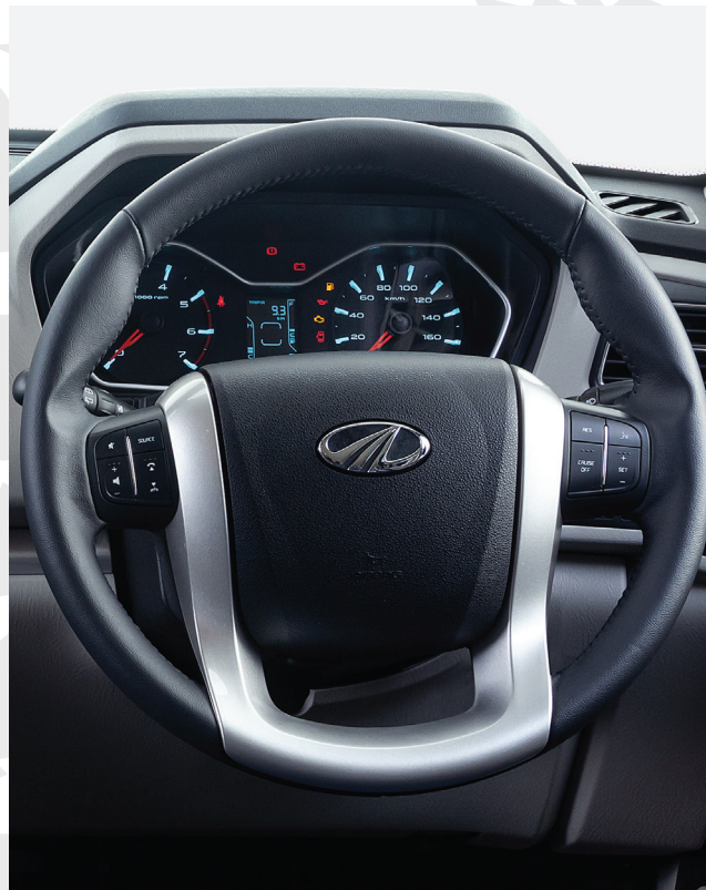
FAUX LEATHER-WRAPPED STEERING WHEEL AND GEAR SHIFT