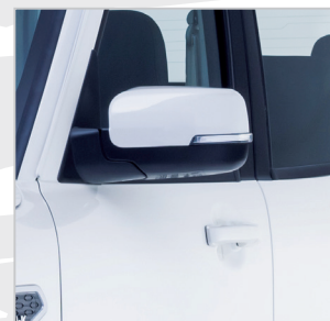
ORVMS WITH SIDE TURN INDICATORS