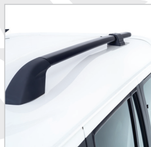
ROOF RACKS INCLUDED