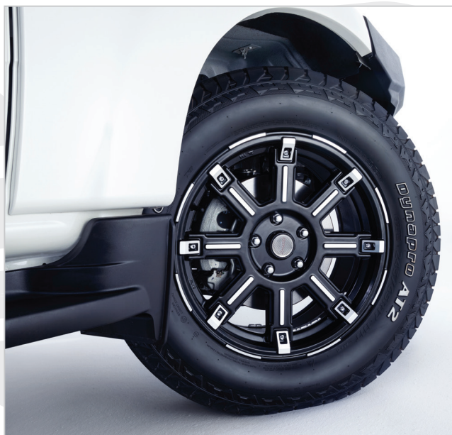
17INCH ALLOY WHEELS, SILK BLACK MACHINED EDGE