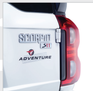
AUTOMATICALLY ACTIVATED HAZARD LIGHTS IN CASE OF SUDDEN BRAKING