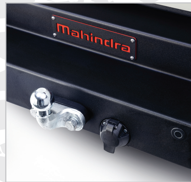
REAR BUMPER, BLACK OFF-ROAD STEEL WITH TOW BAR