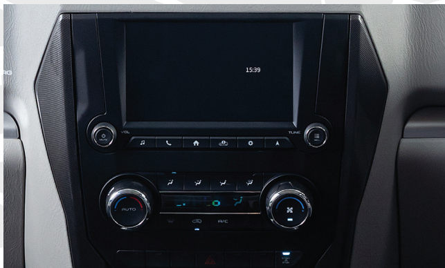
7" TOUCHSCREEN INFOTAINMENT CENTRE WITH BLUETOOTH, AUX AND USB CONNECTIVITY IN ADDITION TO GPS NAVIGATION AND REAR-PARK ASSIST