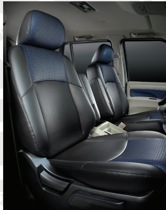
SPACIOUS INTERIORS WITH SEATS FINISHED IN BLACK FAUX-LEATHER WITH NAVY FABRIC INSERTS