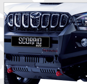
FRONT BUMPER, BLACK OFF-ROAD STEEL