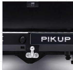
OFF-ROAD REAR BUMPER WITH TOW BAR