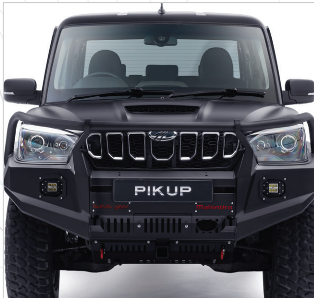
OFF-ROAD FRONT BUMPER