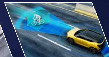
Auto Emergency Braking (Cyclist)