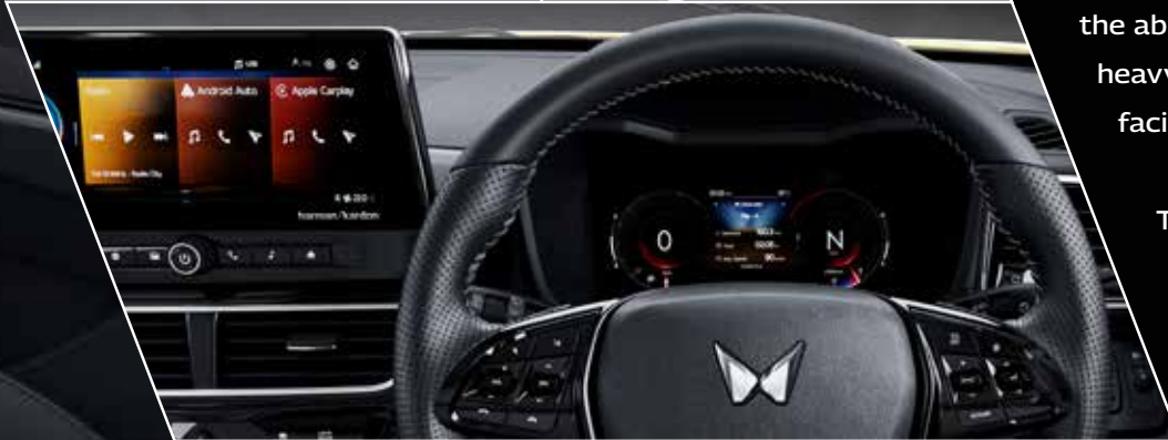
Dual floating high-resolution screens - with the largest 10.25" digital cluster and 10.25" infotainment system

Additionally, Level 2 ADAS with 10 features ensures enhanced driving assistance and safety measures. The inclusion of radar technology aids the ability to detect obstacles in challenging weather conditions such as heavy rain or dense fog, thereby offering crucial collision warnings and facilitating Automatic Emergency Braking (AEB).