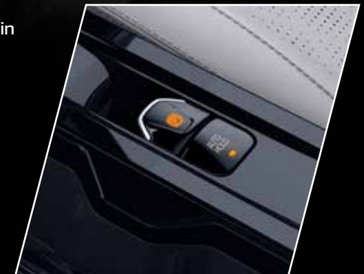
Electronic Power Brake & Autohold

*Specifications may vary by model. Disclaimer: Creative visualisation. For illustrative purpose only.