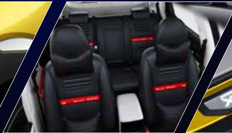
Seat cover - Black with Red Insert