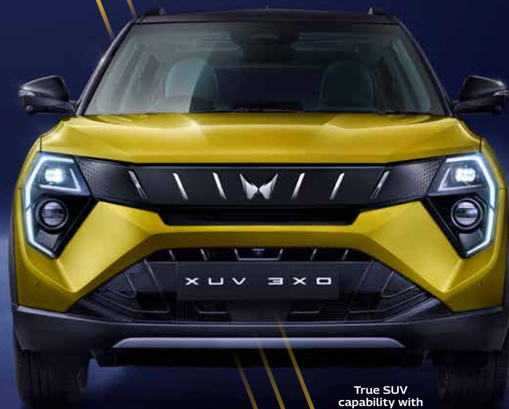
True SUV capability with imposing stance

*Specifications may vary by model. Disclaimer: Creative visualisation. For illustrative purpose only.