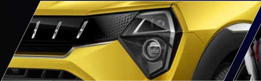
LED fog lamp