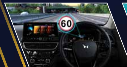
Traffic Sign Recognition