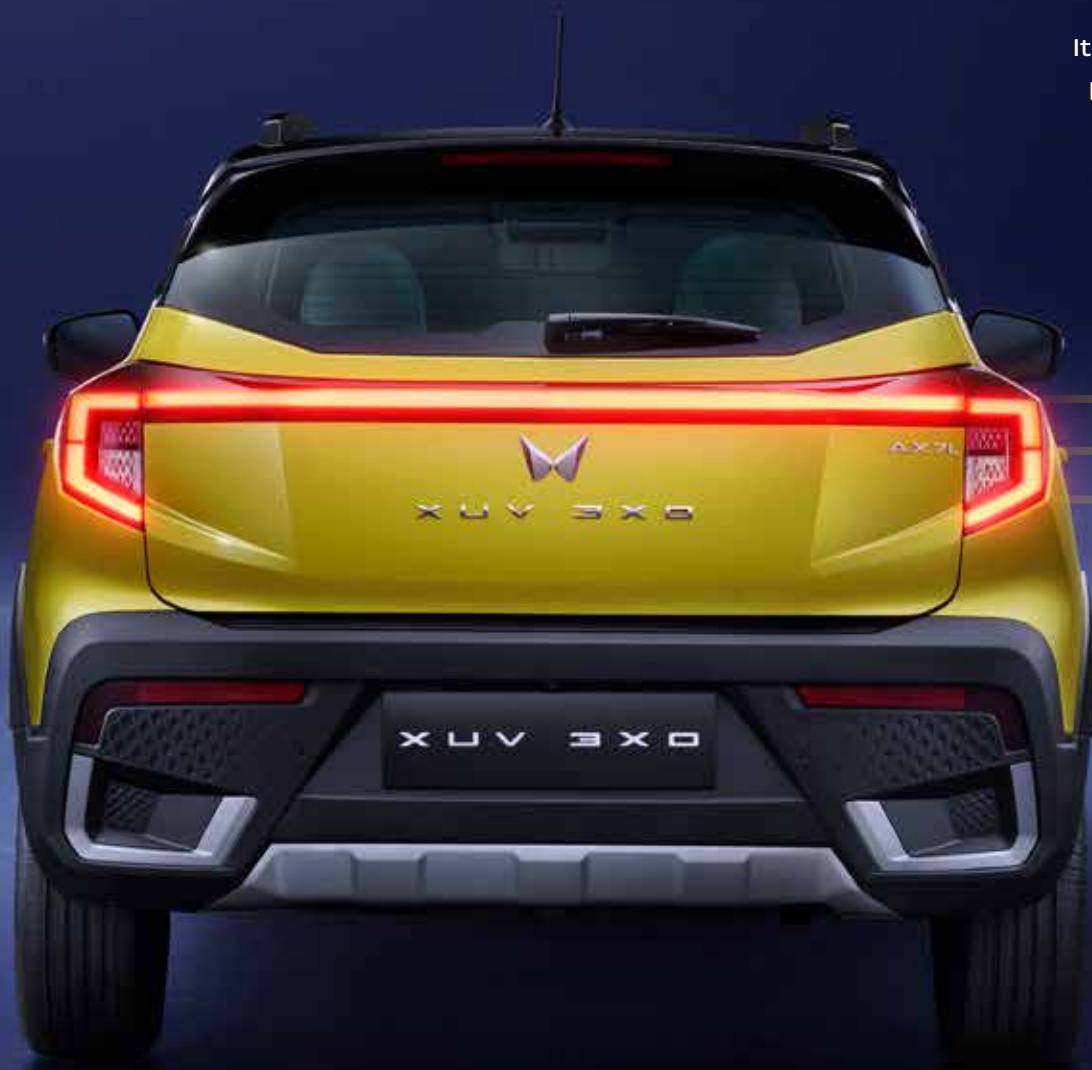
Captivating LED Tail Lamps & Rear Infinity Light Bar

The XUV 3XO's interior complements its striking exterior with a blend of premium finishes and modern design elements and equipment.