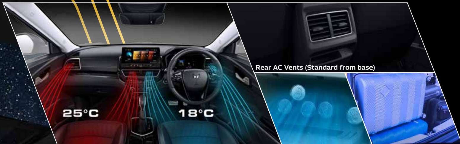
Dual Zone Climate Control