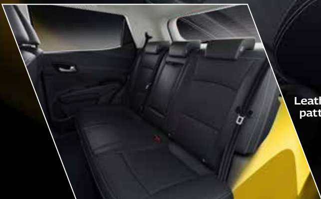
Leatherette seats with diamond-mesh patterns & decorative stitching

**Boot space as per ISO V215. Disclaimer: Creative visualisation. For illustrative purpose only.