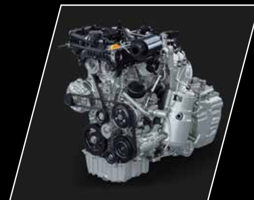
1.2L turbo petrol engine with 82kW power and best in class 200 Nm torque for quick acceleration and fast overtaking