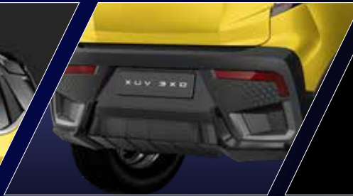
Rear bumper add on