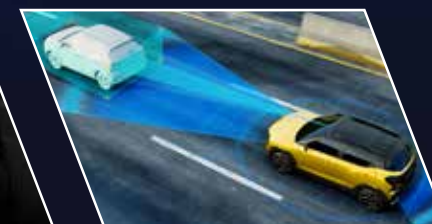
Auto Emergency Braking (Vehicles)

Furthermore, the vehicle comes standard with six airbags, four disc brakes, 3-point seat belts and seat-belt reminder for all seats along with passenger airbag on/off for child safety, ISOFIX child seats with top-tether, among others, providing comprehensive protection for all occupants.