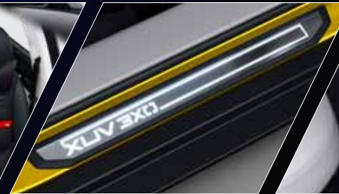
Illuminated scuff plate