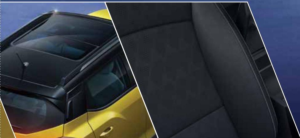
Panoramic Skyroof™ – largest in its class

Its cabin boasts premium interiors with a soft-touch leatherette dashboard that extends to the door trims and leatherette seat upholstery to elevate the sense of sophistication. Leather accents on the steering wheel, gear knob and front armrest further enhance the premium feel.