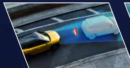
Forward Collision Warning