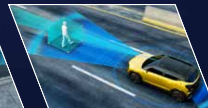
Auto Emergency Braking (Pedestrian)