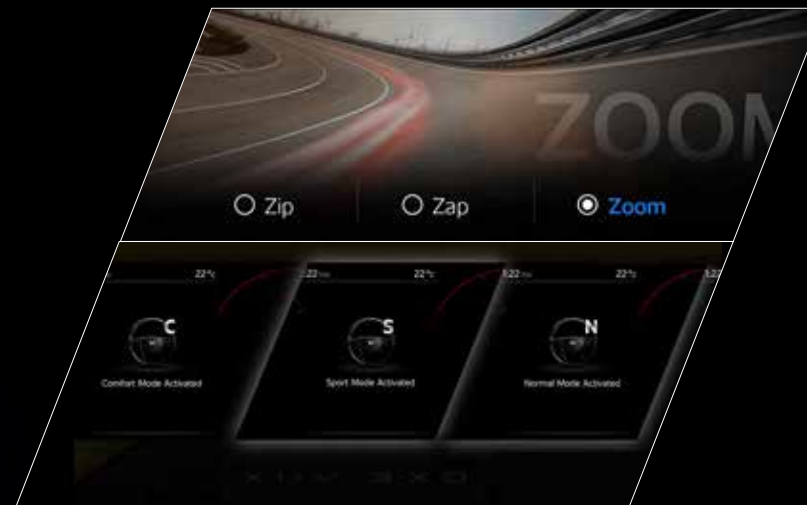
Smart Steering Modes (Standard from base)