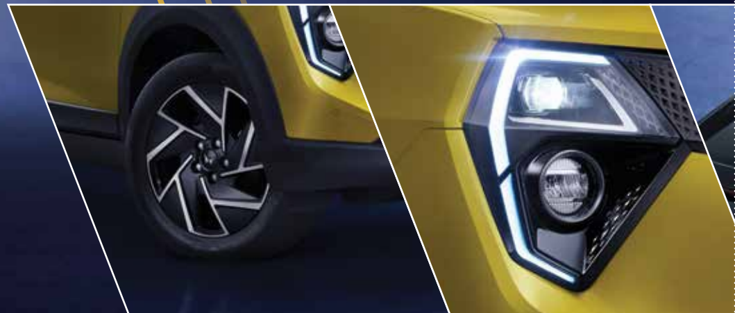
R17 Diamond Cut Alloy Wheels