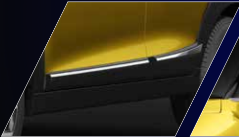
Chrome Cladding Set