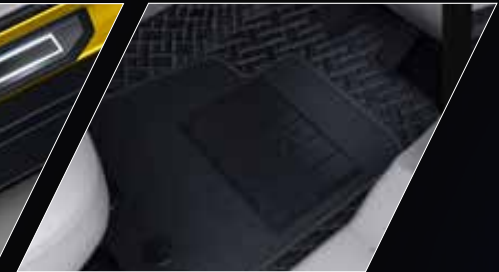
3D floor Mats

Contact you nearest dealer to get a full range of accessories available