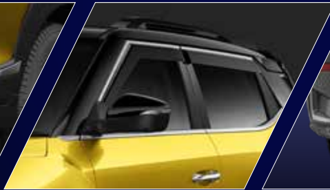
Chrome rain visor